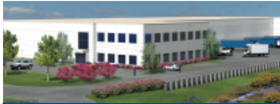
800 DIERKING TER., ELK GROVE VILLAGE