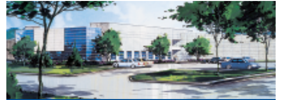
695 TOUHY AVE., ELK GROVE VILLAGE