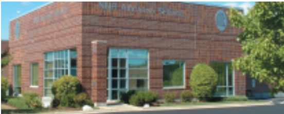
800 DILLON AVE. (UNIT 1), WOOD DALE