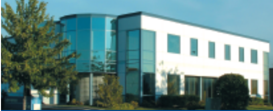
959 A.E.C. DRIVE, WOOD DALE