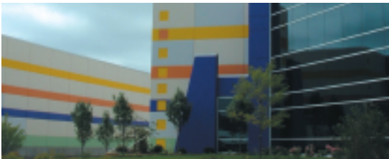
2315 LANDMEIER, ELK GROVE VILLAGE