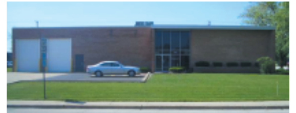
1101 LUNT AVE., ELK GROVE VILLAGE