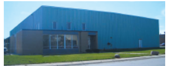
2195 ARTHUR AVE., ELK GROVE VILLAGE