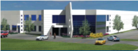
1020 WOOD DALE RD., WOOD DALE