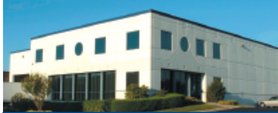
939 AEC DRIVE, WOOD DALE