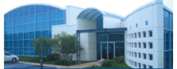
265 SPRINGLAKE, ITASCA