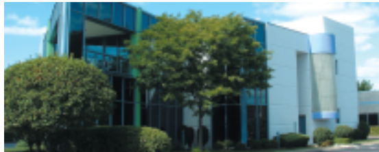
1100 LANDMEIER RD., ELK GROVE VILLAGE