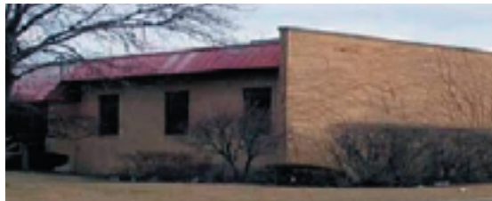
1125 TOUHY AVE., ELK GROVE VILLAGE