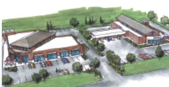
WOOD DALE & DEVON STS., WOOD DALE