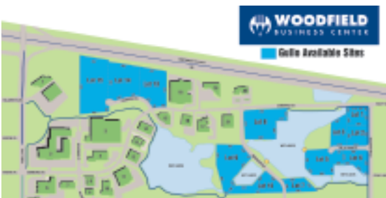
WOODFIELD BUSINESS CENTER